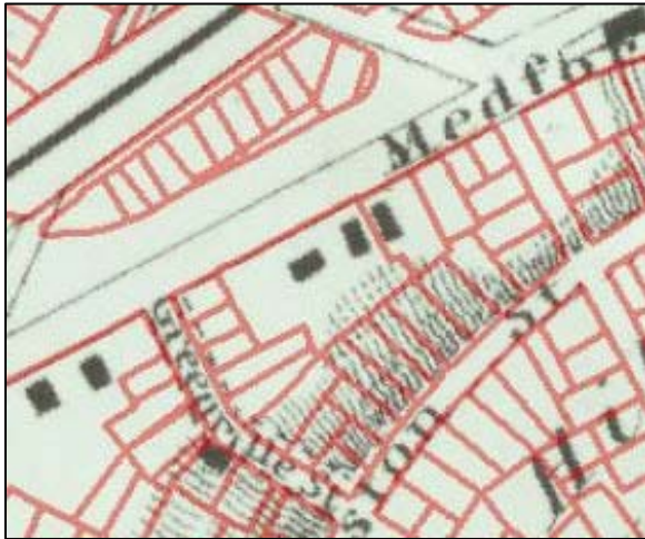
1852 Draper with current boundaries overlaid – House existent at this time.