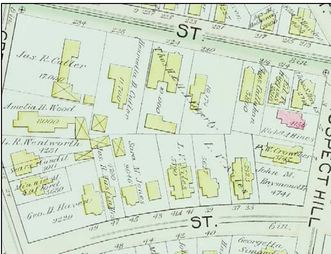
1895 Bromley Plate 1