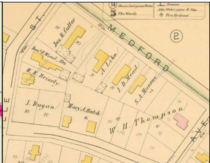
1884 Hopkins Plate 4